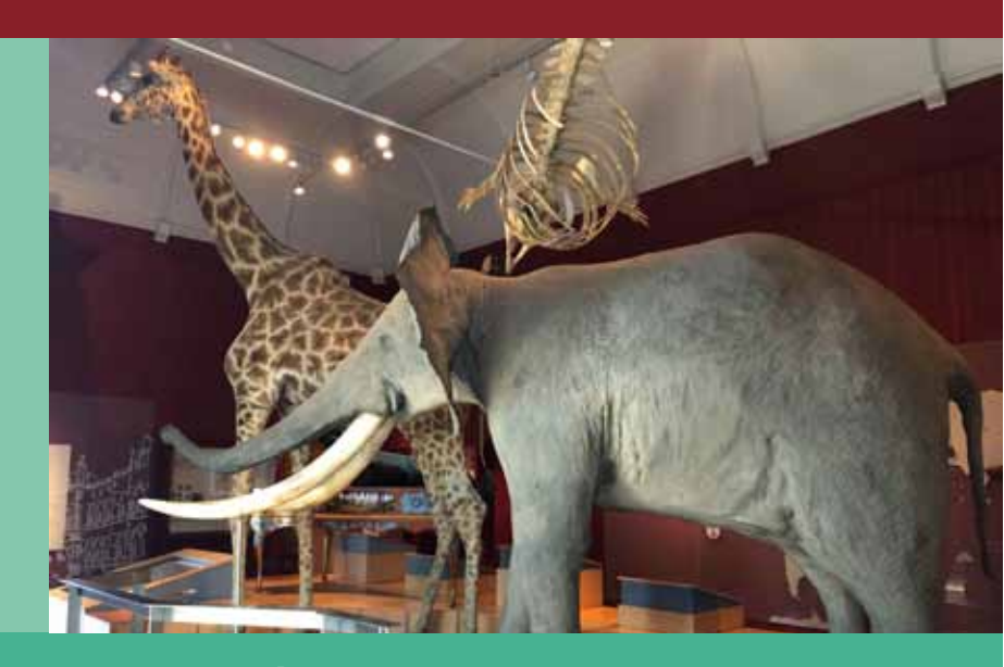
Royal Albert Memorial Museum • www.exeter.gov.uk/ramm

A voyage of discovery from Exeter and all around the world